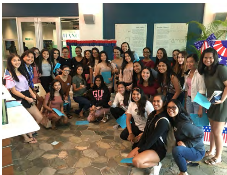
Students from the Academy of Lady of Guam participated in the Constitution and Citizenship Day event at the Guam Museum on September 17, 2017.