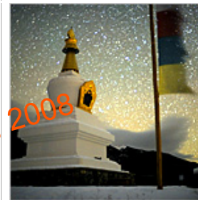
For Followers, Sacred Ground in Colorado