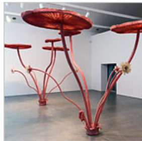
Personal History, Captured in Plastic