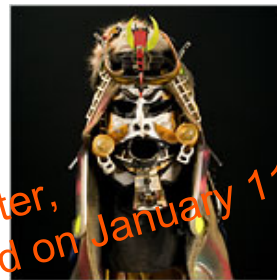
Face Time: Masks, Animal to Video