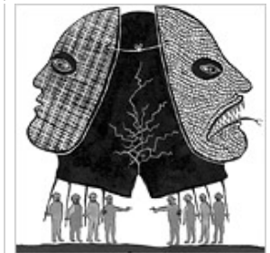
Op-Ed: On the Brink, Kenyan Democracy