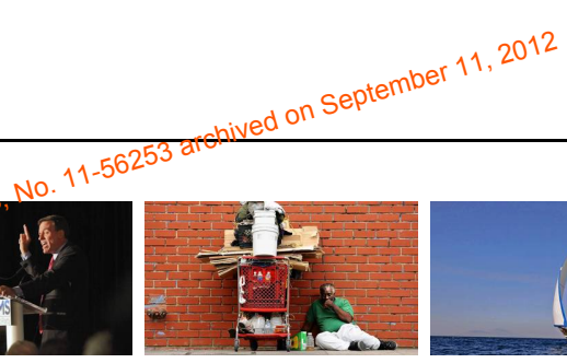
property of homeless