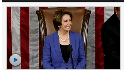
VIDEO: Pelosi welcomes 113th Congress