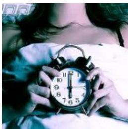
Sleeping Disorder Statistics