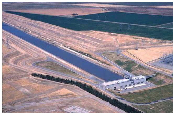
Sacramento - San Joaquin Delta