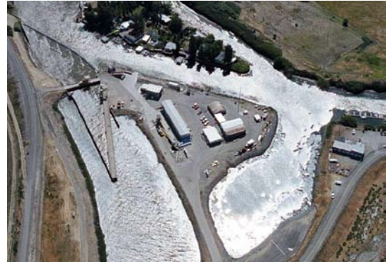
Tracy Fish Collection Facility

The Tracy Fish Collection Facility is a complex system of louvers, bypasses and holding tanks operated to protect and salvage fish, natural to the area, from the nearby C.W. “Bill” Jones Pumping Plant. The facility collects Sacramento-San Joaquin Delta fish species as a primary mitigation feature for the pumping plant and returns them to the Delta.