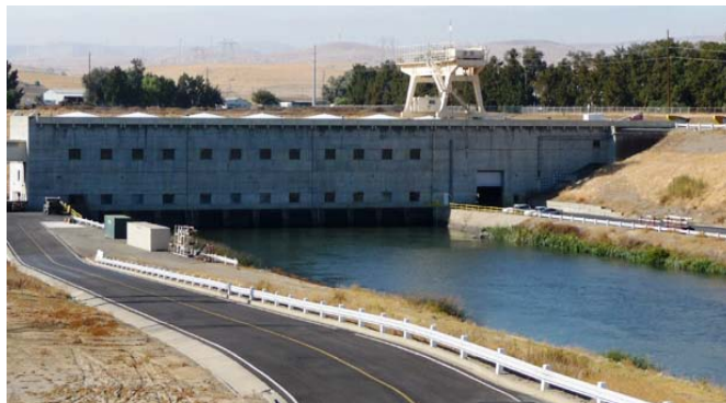
C.W. "Bill" Jones Pumping Plant

The plant is located near the Tracy Fish Collection Facility, which diverts threatened and endangered fish away from the pumps to meet regulatory requirements. As long as the fish facility is in operation, the pumps can operate.