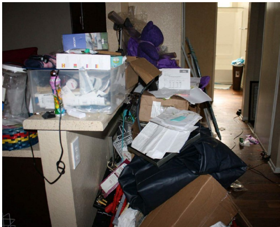
Rotted food was piled up in the kitchen and littered across countertops.