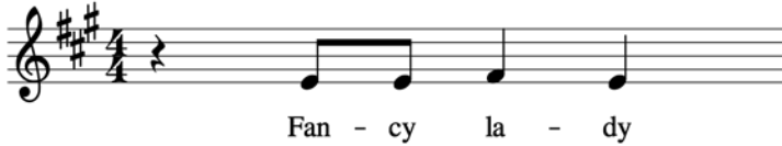
Theme X in "Got to Give It Up"

can't hear.” Like the Hook Phrase, Theme X is both unprotectable and objectively dissimilar in the two songs.