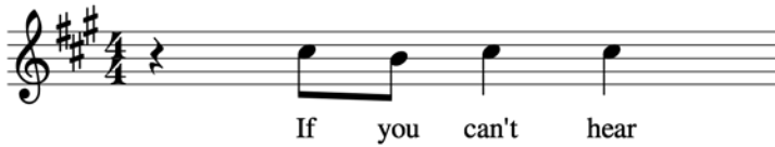
Theme X in "Blurred Lines"