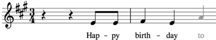
Theme X in "Happy Birthday to You"

The pitches and rhythm of Theme X in the deposit copy are identical to those sung to "Happy Birthday" and numerous other songs. None of the Theme X pitches in the deposit copy are the same as in "Blurred Lines." To see any correspondence between the two four-note sequences, one would have to shift and invert the pitches, a feat of musical gymnastics well beyond the skill of most listeners. Where short and distinct musical phrases require such contortions just to show that they are musically related, there is no basis to find them substantially similar. See Johnson , 409 F.3d at 22; see also Arnstein , 82 F.2d at 277.